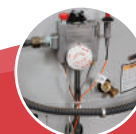
Water Heater Installation

Located in Stewartstown, PA | 717-880-3273 | www.evenflopro.com | EvenFloPros@Gmail.com