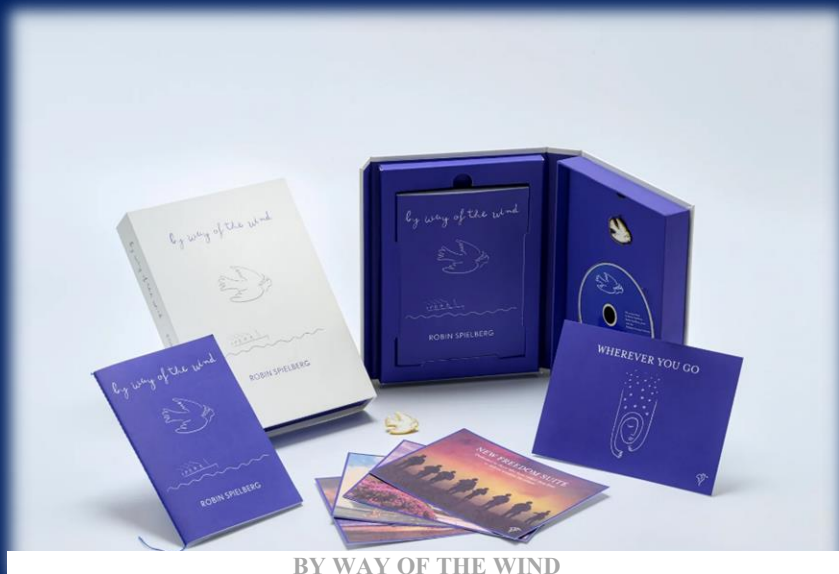
BY WAY OF THE WIND

Yes! 2026 marks my 30th anniversary as a touring musician and 40 years of making my living playing piano. So far there are dates on the calendar for the northeast and Midwest. My schedule is on my web site at robinspielberg.com